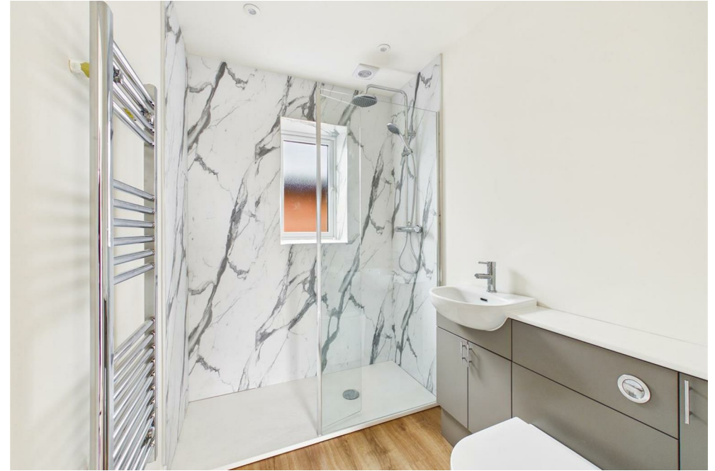
Plot 22 Maes Neuadd, Churchstoke, Montgomery, SY15 6DW £260,000

Well designed two bedroom bungalows with a modern layout, located in the popular village of Churchstoke, which has a extensive range of amenities including a large supermarket. The village is surrounded by beautiful countryside and it is only a short drive from the market town of Welshpool.